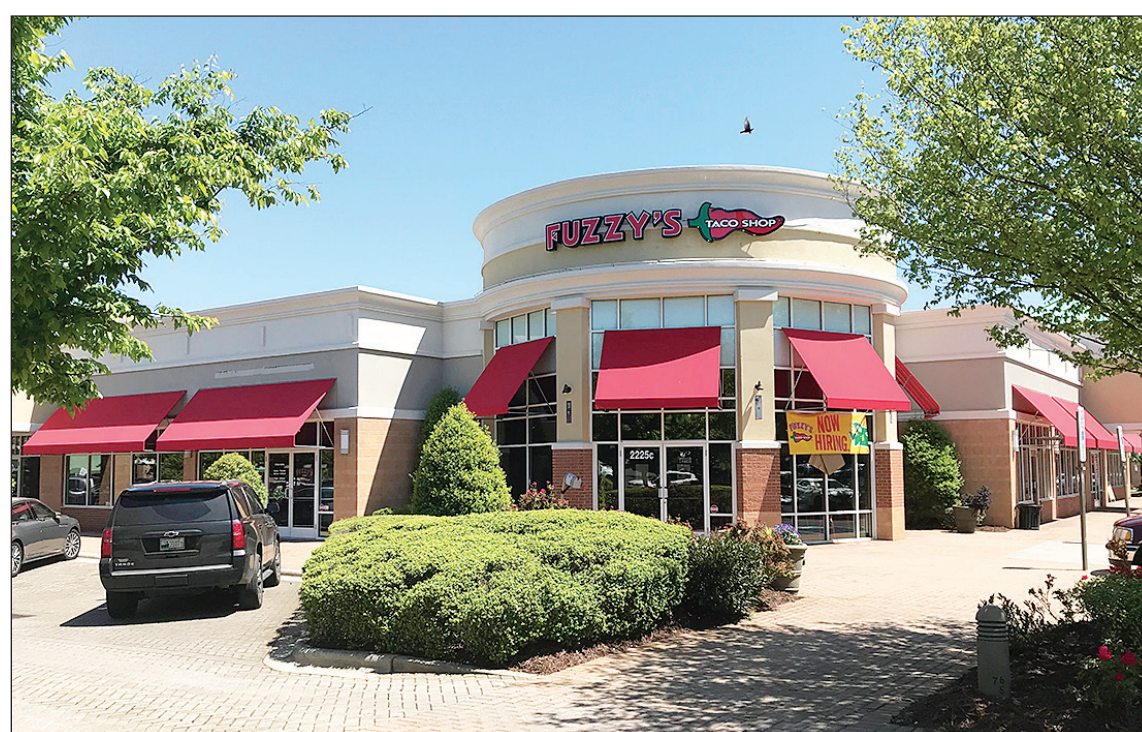
Matthews-based Southern Deli Holdings is introducing the town to Fuzzy's Taco Shop.